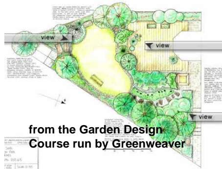
from the Garden Design Course run by Greenweaver

These courses are run by trainers qualified in their specific subject